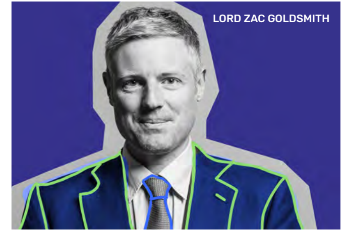
LORD ZAC GOLDSMITH

GLOBAL SOUTH CO CHAIR OF THE COP26 CIVIL SOCIETY AND YOUTH ADVISORY COUNCIL AND THE FOUNDER OF THE GREEN GENERATIONAL INITIATIVE