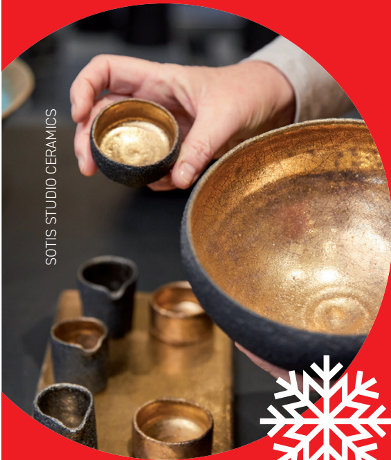
SOTIS STUDIO CERAMICS